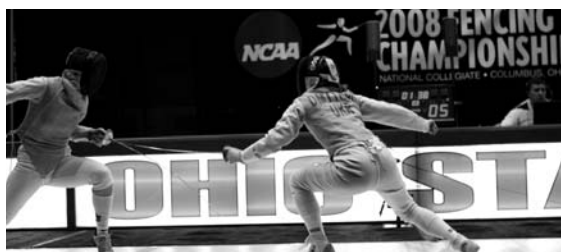
SEASON IN REVIEW