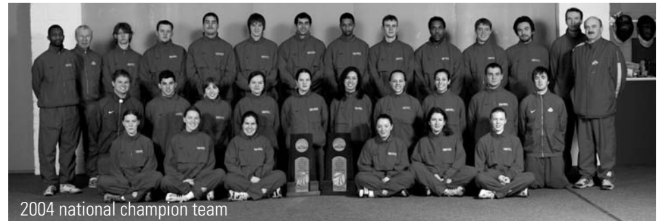
2004 national champion team