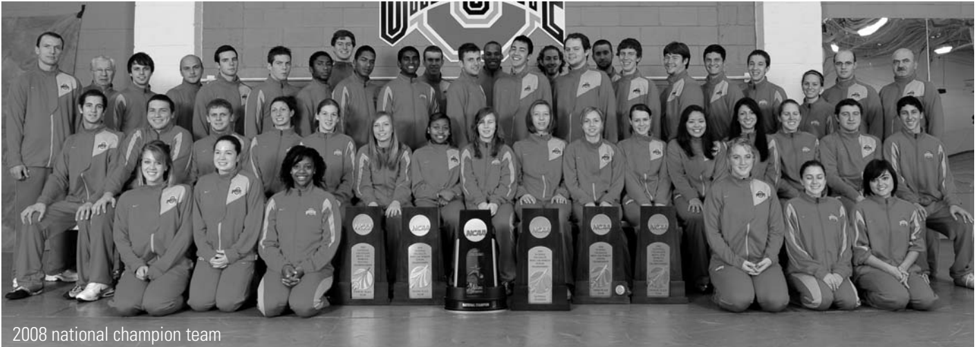
2008 national champion team