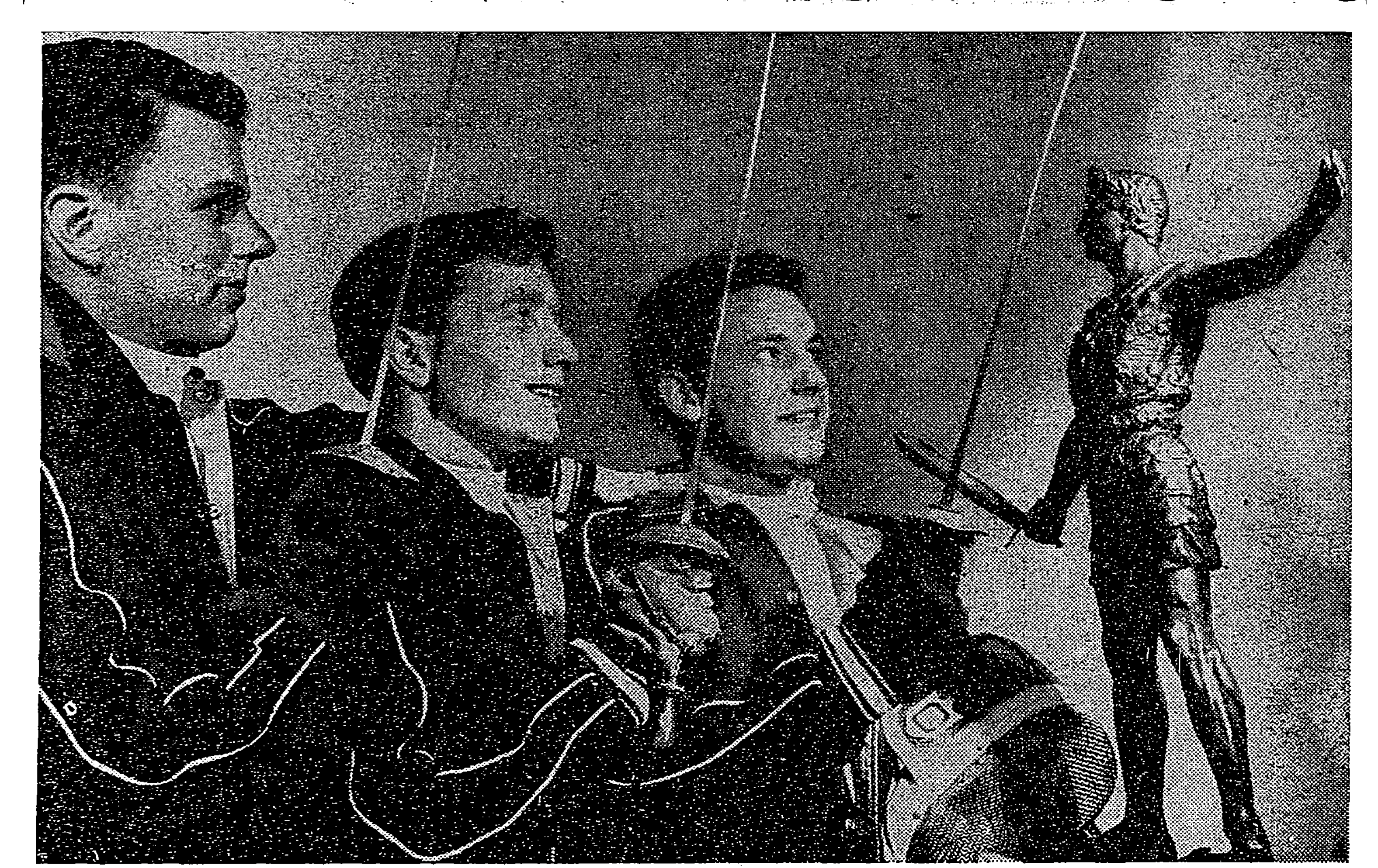
Members of Big Red squad saluting the Little Iron Man, oldest of intercollegiate athletic trophies, after Ithacans tied Columbia for first place in foils division at championship