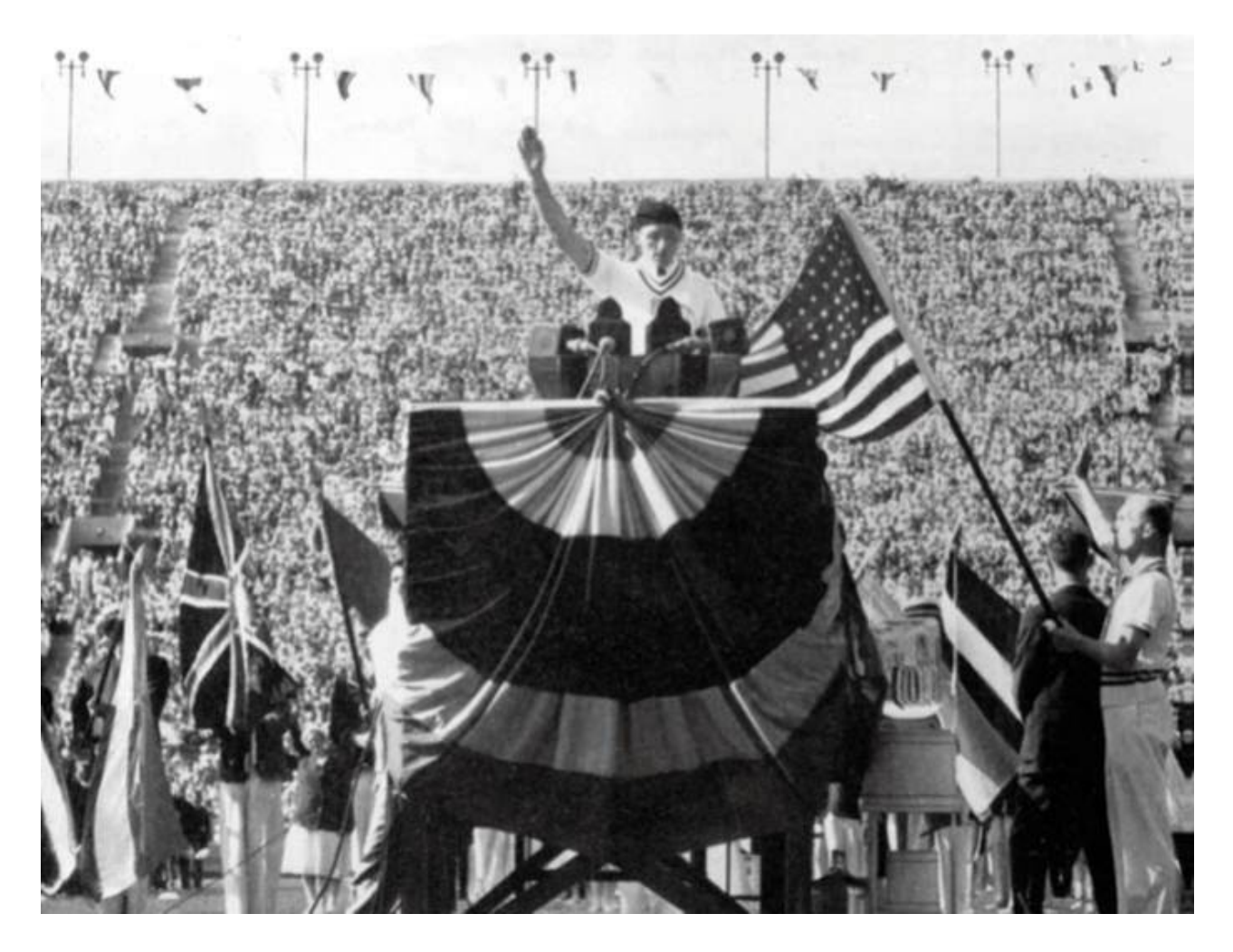
LT George Calnan taking the Olympic Oath on behalf of the athletes at the 1932 Olympic games in Los Angeles. Calnan perished in the line of duty the following year, in the crash of the airship USS Akron (ZRS-4) on 4 April 1933.