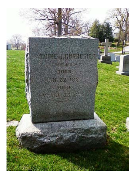
Antoine J. Corbesier's headstone in the cemetery on Hospital Point