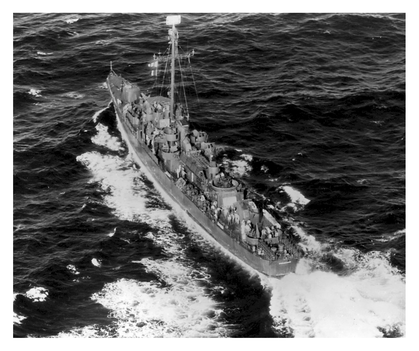
USS Corbesier DE-438, undated wartime photo <a href="http://www.navsource.org/archives/06/438.htm">http://www.navsource.org/archives/06/438.htm</a>